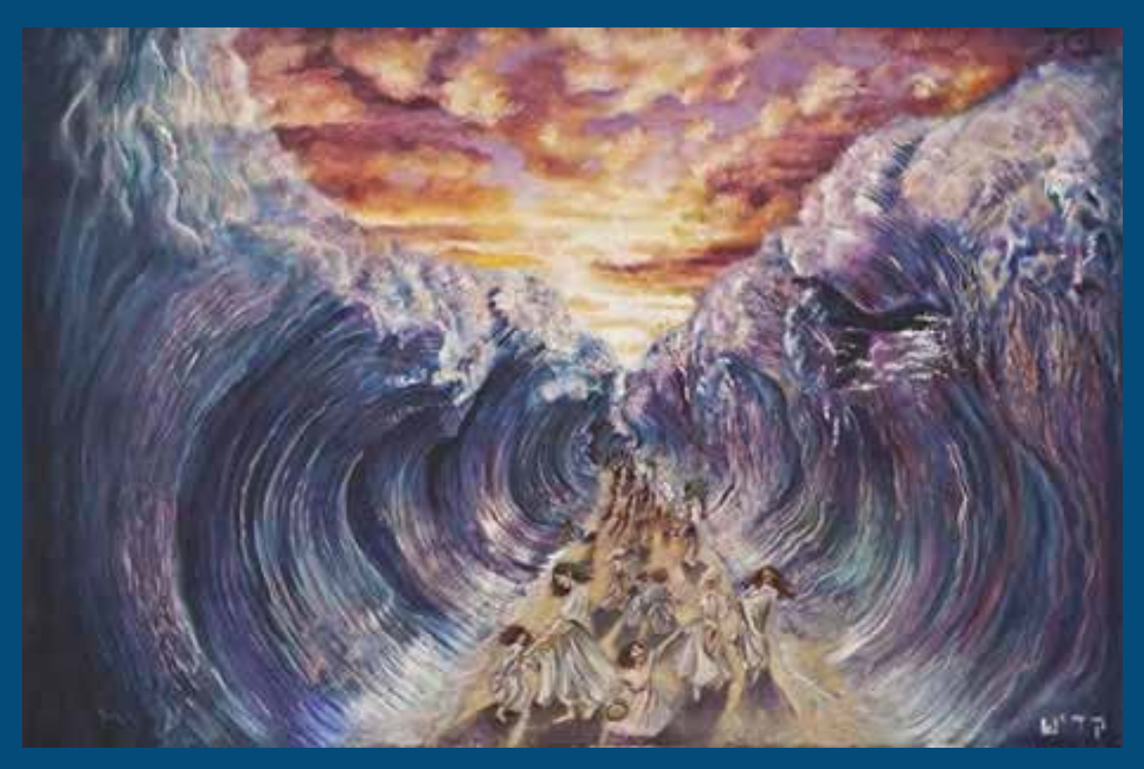
"The Splitting of the Sea" by Natalia Kadish

The sea parted and the Israelites sang and danced through the parted waves rejoicing their new found freedom.